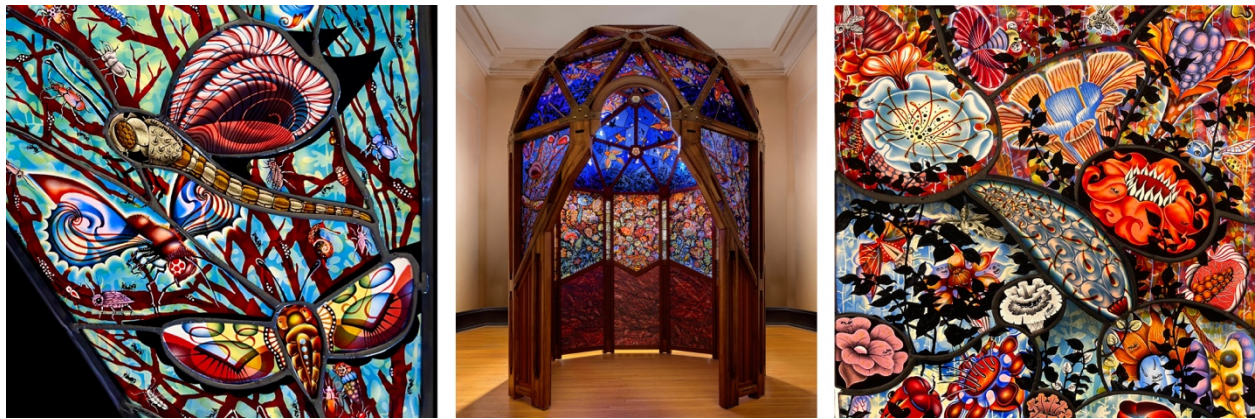
(L&R) Judith Schaechter, Super/Natural, (Detail, panels) (C) Judith Schaechter, Super/Natural, stained glass and wood construction, 96 x 60 x 60 in, 2025

"My goal is to invite viewers into a deeply personal, immersive experience that explores the connections between self, nature, and imagination," Schaechter said. "We are ultimately connected to, not just observing, nature."